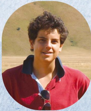
Blessed Carlo Acutis