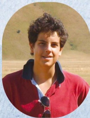
Blessed Carlo Acutis