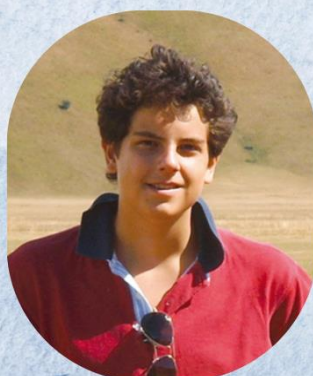
Blessed Carlo Acutis