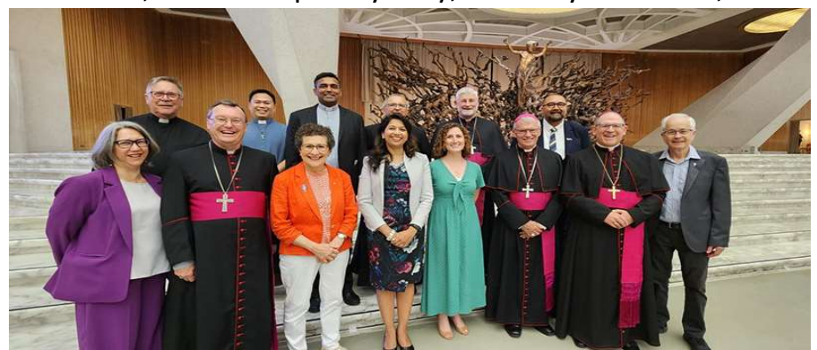
Our fourteen Australian representatives.

Live transmissions of some events will be available at vaticannews.va ; the Vatican Synod website can be found at synod.va .