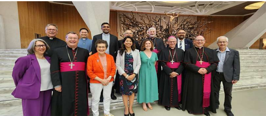
Our fourteen Australian representatives.

Live transmissions of some events will be available at vaticannews.va; the Vatican Synod website can be found at synod.va.