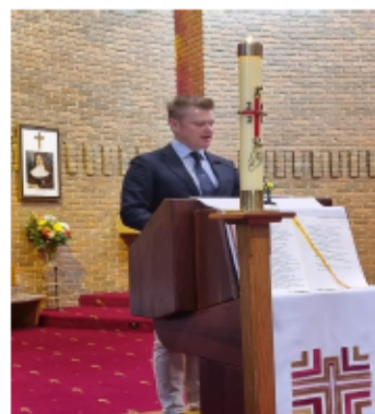
2023 St Gregory's the Great Photos inserted