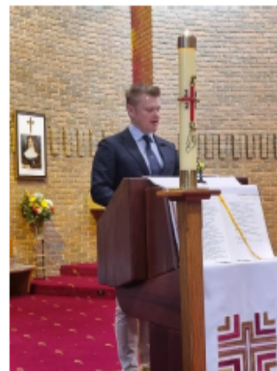
2023 St Gregory's the Great Photos inserted

At – St Kevin's Parish. 26-44 Herlihys Road. Templestowe Lower.