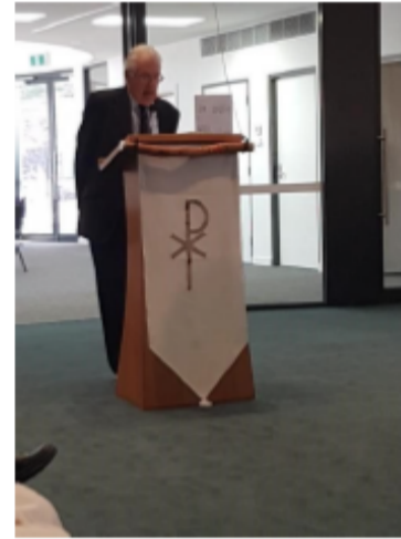
2018 Photos inserted

At – St Gregory the Great Church 71 Williamsons Road, Doncaster