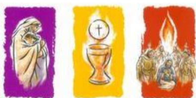
Preparing Children for Reconciliation, First Holy Communion and Confirmation