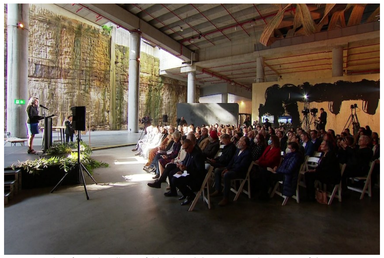
Representatives from nine diverse faiths signed the statement in support of the referendum.

"I urge us all to follow the example of these religious organisations ... let us put our differences aside and work together towards a successful referendum."