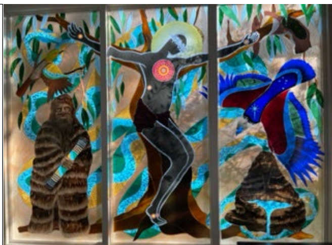
Photo of the stain glass wall in the Chapel at the Ministry depicting our Lord Jesus Christ in the centre flanked by an Aboriginal holding the message stick and Australian fauna and fauna, signifying God's presence surrounding us in Mother Earth.

Our faith calls us to just action and to educate the community to end division and misunderstanding. This is what I intend to do, starting small with family and friends.