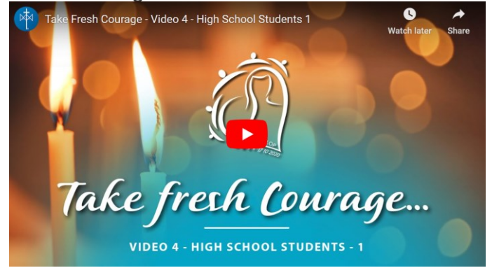
Video 4 – High School Students