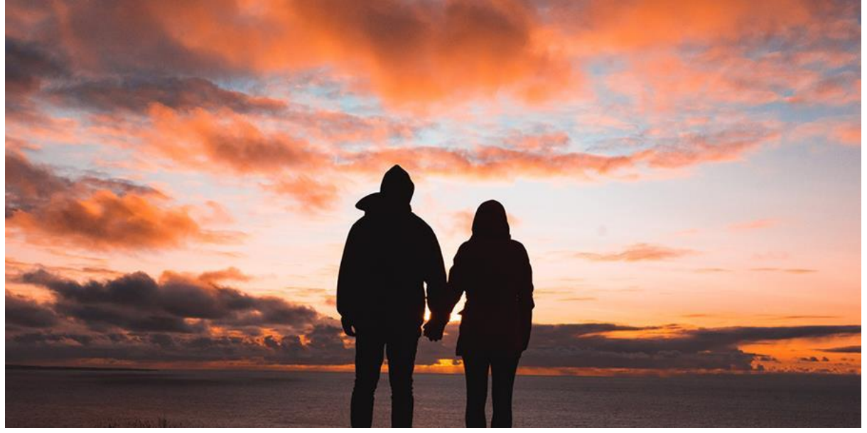
Daily living of the loving

We have a rare opportunity to celebrate love and God in a very public way at a wedding, but how about in everyday life?