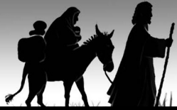
The Holy Family of Jesus, Mary and Joseph