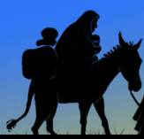
The Holy Family of Jesus, Mary and Joseph

An angel appeared to Joseph in a dream and told him to take Mary and Jesus to Egypt. Draw the angel speaking to Joseph in his dream.