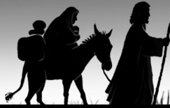
The Holy Family of Jesus, Mary and Joseph

An angel appeared to Joseph in a dream and told him to take Mary and Jesus to Egypt. Draw the angel speaking to Joseph in his dream.